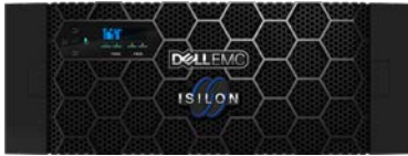
Dell EMC Isilon F800 All-Flash

The new generation of Isilon hardware systems allow you to consolidate and support a wide range of file workloads. With an ultra-dense, modular architecture that provides four Isilon nodes within a single 4U chassis, Isilon systems enables organizations to reduce data center space requirements and related costs by up to 75%. The new Isilon platforms seamlessly integrate with existing Isilon clusters.