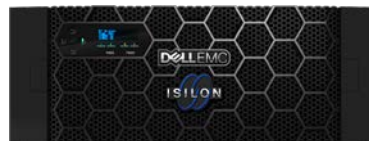
Dell EMC Isilon H500