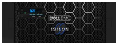
Dell EMC Isilon H400