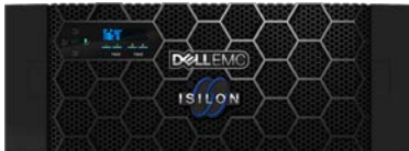
Dell EMC Isilon H600